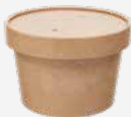
1. Kraft + kraft lid