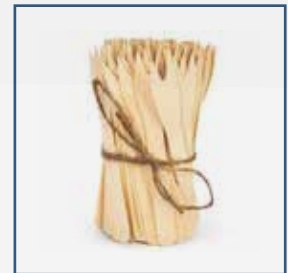
WOODEN PICK FRIES