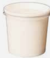
3. White cardboard + plastic lid