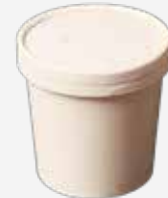
4. White + white cardboard lid