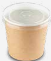
2. Kraft + plastic lid