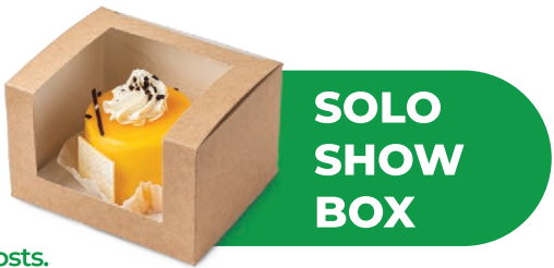
SOLO SHOW BOX